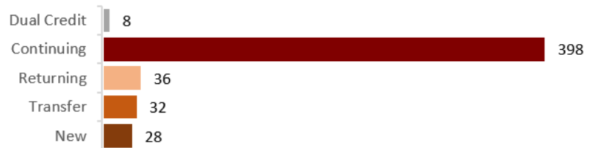
Enrollments by Degree Level